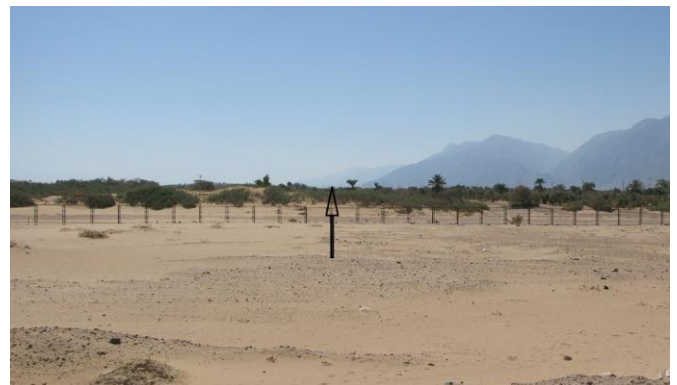
Looking SSW from the northern end of the runway