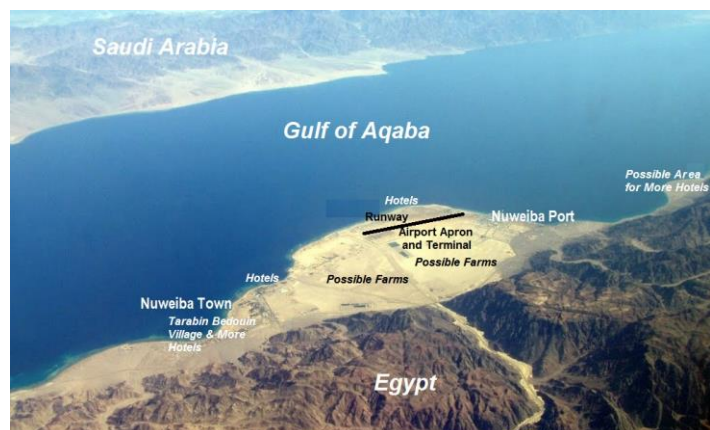
Location of the proposed new airport