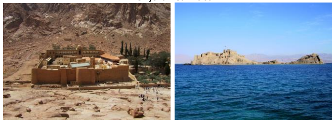
St Catherine Monastery & Pharaohs Island

There are beautiful sandy beaches, amazing underwater coral reefs, magnificent mountains, valleys and canyons, and the area is rich in cultural and historic sites such as the Monastery of St Catherine, the ancient burial grounds of Navamis, Salah el Deen Castle on Pharaohs Island and Tarabin Fortress.