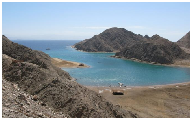
The Fjord near Taba