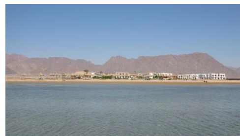
Resort Hotels at Nuweiba

Apart from a few, minor, other industries, such as fruit and vegetable growing, transportation and fishing, tourism is by far the major industry and employment provider in the area, and East Sinai has the potential to become Egypt's third largest tourist destination after Sharm el Sheikh and Hurghada