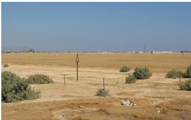
Looking NNE from the southern end of the runway

2.15 million – which is almost 3 to 5 times the amount that Taba Airport ever achieved. These figures do not even take into account the number of guests that would be visiting on a day-trip – i.e. from Cairo to St Catherine or from East Sinai to Cairo, or the possibility of business visitors and freight moving through in conjunction with business at the nearby Nuweiba Port.